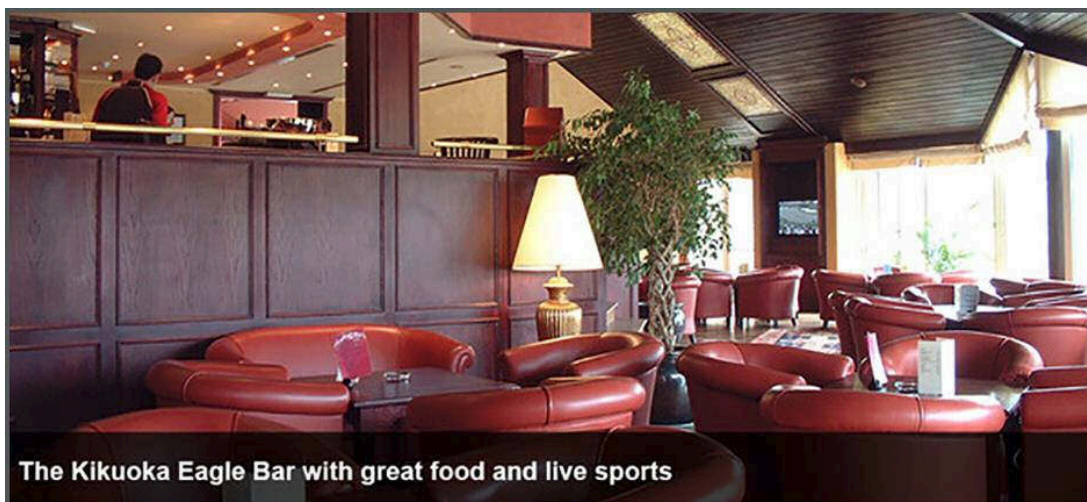
The Kikuoka Eagle Bar with great food and live sports